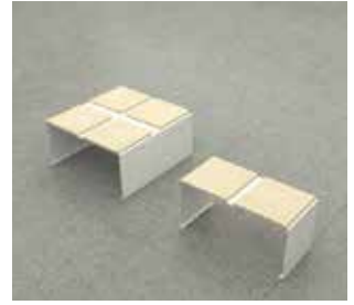
Furniture Galvanized and painted. Built to withstand the abuse of a coin laundry environment