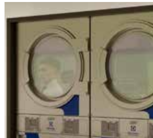
Frame Washers and Dryers Built to last plasterboard frames covered with sheet steel galvanized