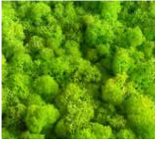
Vertical green Natural lichen that can be used only indoors. ▶ no maintenance required