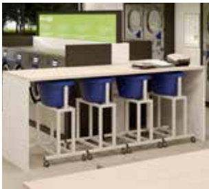
Laundry cart station Galvanized and painted