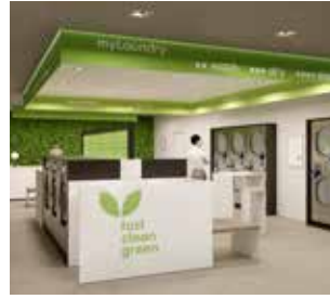
Light frame Dibond aluminum panels, technologically advanced ceiling fixing system