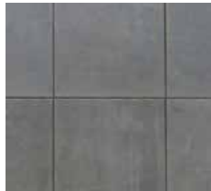
Floor tiles High performance flooring in porcelain tile with glazed surface